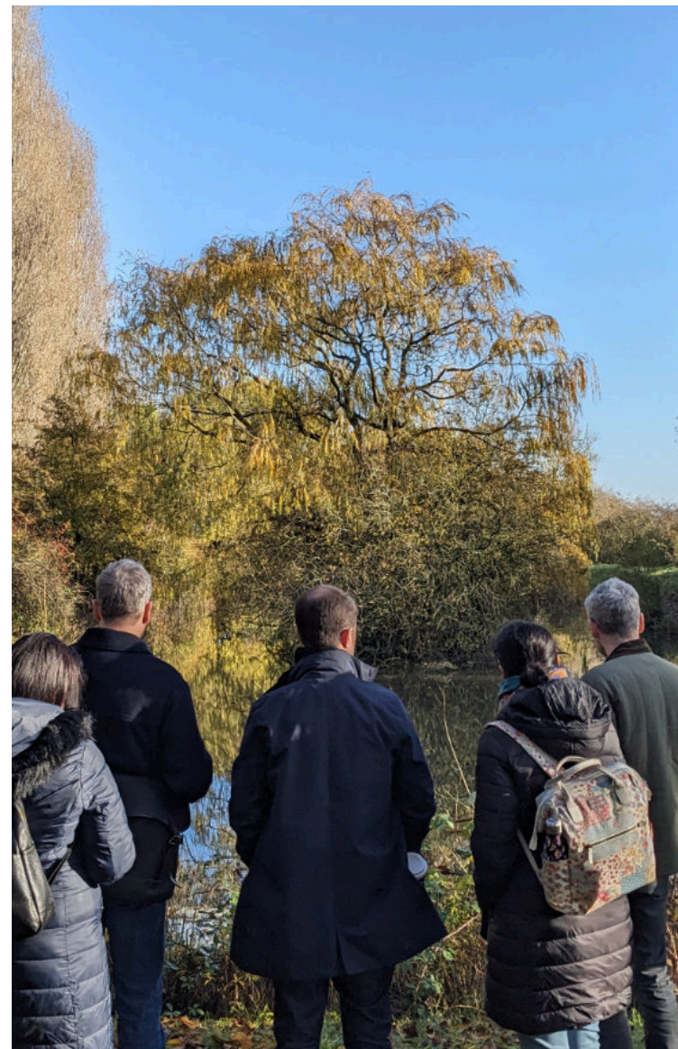
Design review panel site visit

As a public authority, the planning authority is subject to the Freedom of Information Act 2000 (the Act). All requests made to the planning authority for information with regard to the Independent Design Review Panel will be handled according to the provisions of the Act. Legal advice may be required on a case by case basis to establish whether any exemptions apply under the Act.