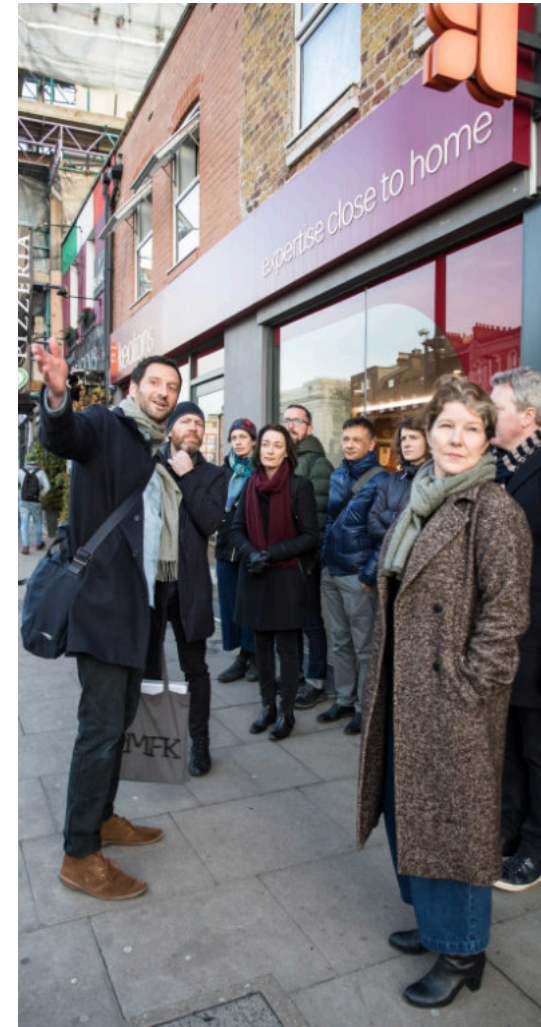
Design review panel site visit

Large projects, for example schemes with several development plots, may be split into smaller elements, to ensure that each component receives adequate time for discussion.