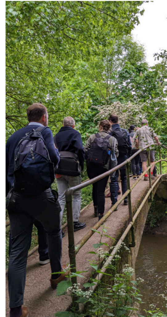
Design review panel site visit

This terms of reference describes the Independent Design Review service that we offer to local planning authorities. These services can be provided either on a one-off basis, or as part of ongoing collaborative working with a Council.