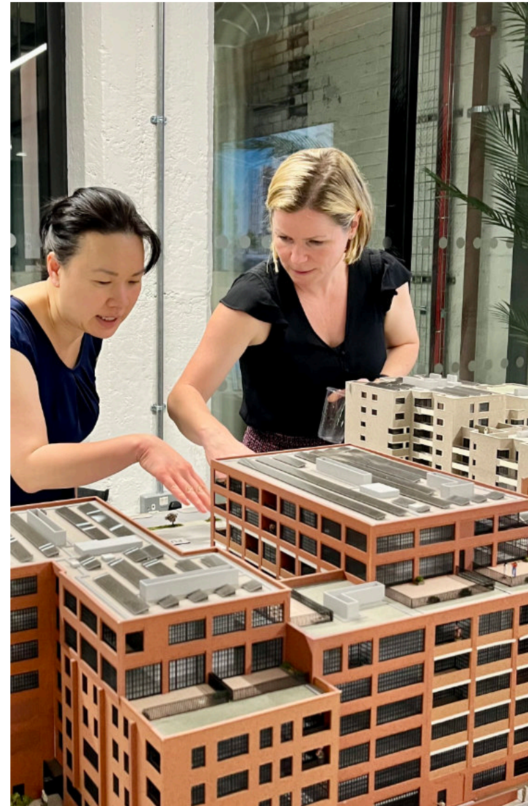
Design review meeting

Membership of the panels managed by Frame Projects is reviewed regularly, to ensure that we can provide a variety of expertise, and to bring fresh perspectives of new panel members into the process.