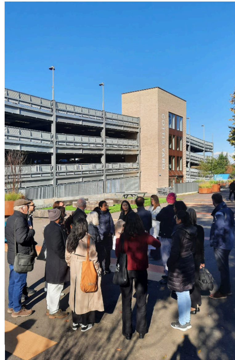
Design review panel site visit

If the proposal is reviewed at an application stage the report will be a public document kept within the proposal's case file and published on the planning authority's website. Where the final review of a scheme takes place at a pre-application stage, the report of this meeting may also be made public once an application is submitted.