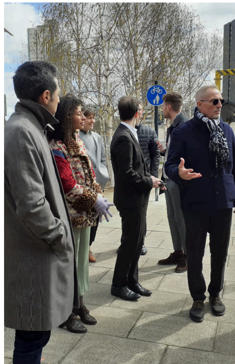
Design review panel site visit