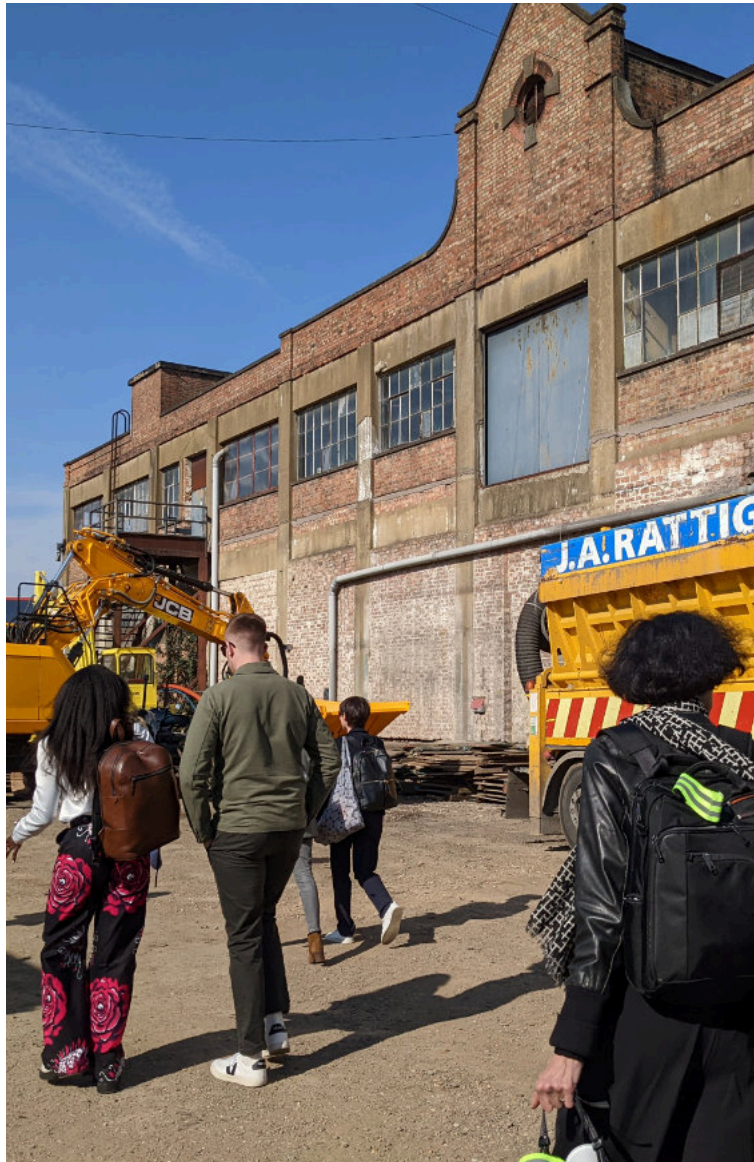
Design review panel site visit