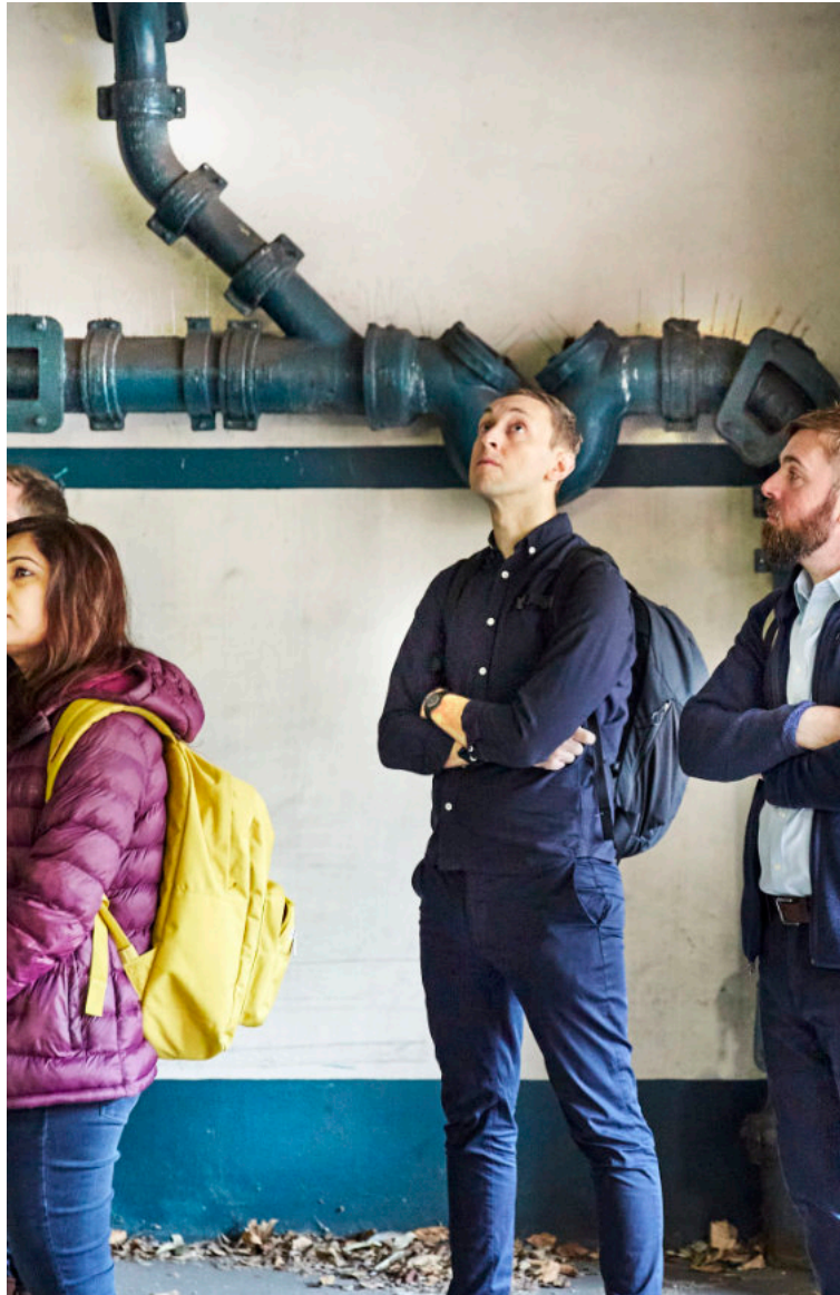
Design review panel site visit