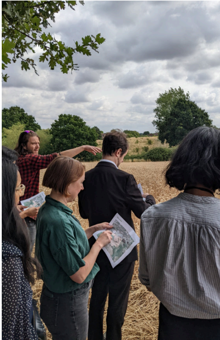
Design review panel site visit