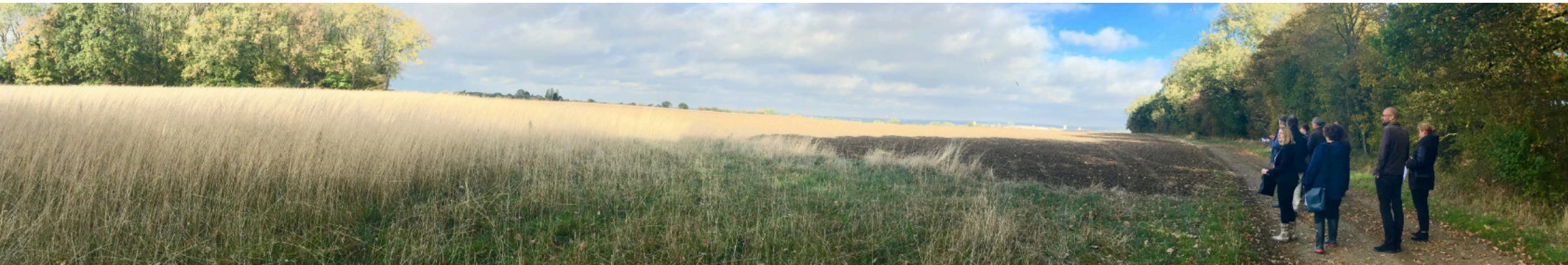
Design review panel site visit

Design Review: Principles and Practice Design Council CABE / Landscape Institute / RTPI / RIBA (2013)